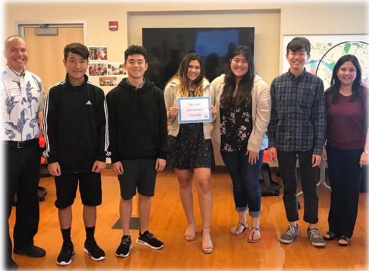
'Iolani School Students