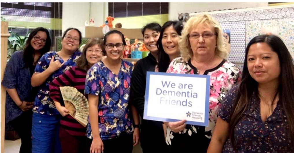
Windward Oahu Public Health Nursing Section