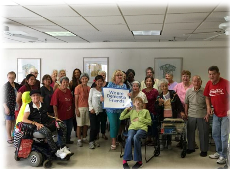
Honolulu Community Action Program Kailua Seniors