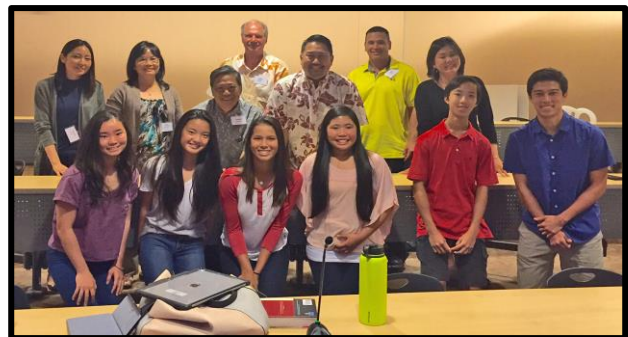
Iolani students meet with State and City traffic engineers

This past semester, Iolani School's "One Mile Project" class studied age-friendly communities and design thinking. The class project focused on creating innovative, age-friendly design solutions to the congested intersection of Kapiolani Boulevard and Date Street for improved pedestrian safety. One student is also pursuing a "GoGo Grandparent" pilot project in partnership with Plaza Assisted Living to provide on-demand transportation service.